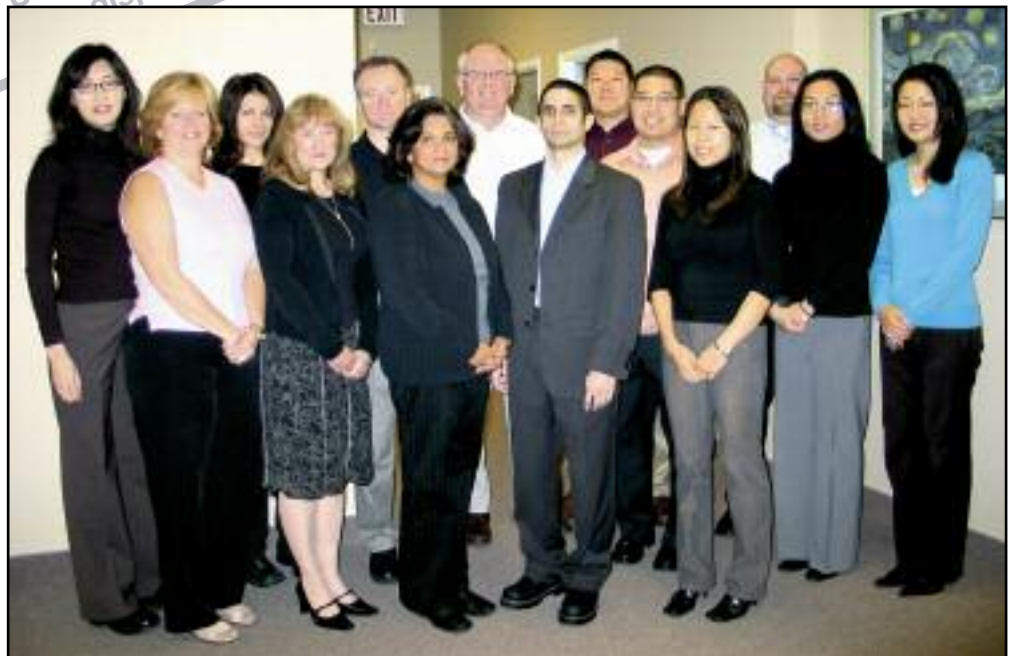
PAAB Staff 2007.